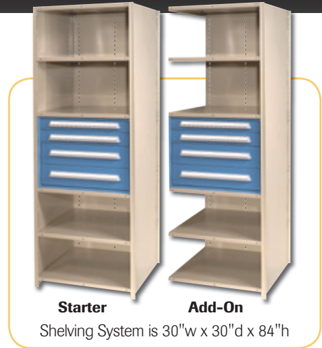
Shelving System is 30"w x 30"d x 84"h