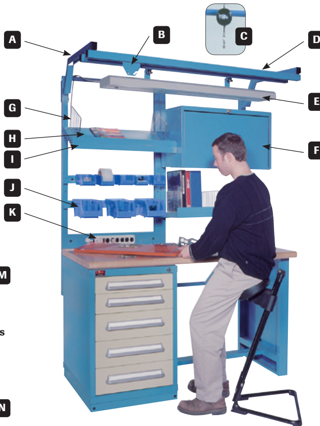
Sky-Wal II™ components are not compatible with Slide Bolt Leg Benches.