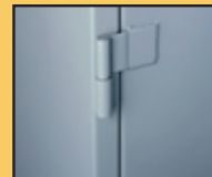
Three heavy-duty \frac{5}{16} " diameter steel pin hinges securely welded to each cabinet door

IN STOCK ALL ITEMS ON THIS PAGE ARE FOR IMMEDIATE SHIPMENT