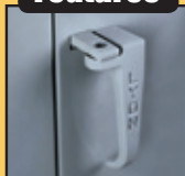
Rugged cast iron handles with \frac{3}{8} " thick padlock hasp