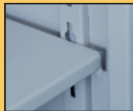
Heavy-duty 14-gauge flanged shelves, adjustable on 3" centers