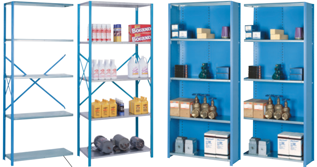
Five Shelf Open Add-On