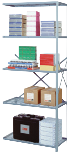
Five Shelf Open Add-On