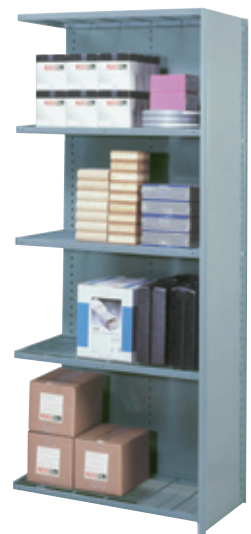
Five Shelf Closed Add-On