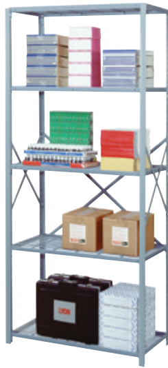
Five Shelf Open Starter