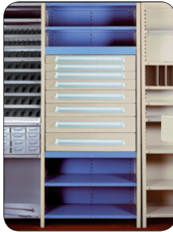
Modular drawer installation should have a shelf directly above and below the drawer guide support as shown.