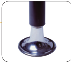
2160 Glides Large steel glide with 2 1/2" diameter. Fits 2020, 2030 series