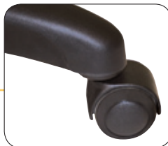
2165 Caster Reverse braking caster brakes when seat is occupied. Fits 2016, 2040, 2080 series