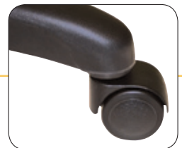
2163 Caster Braking casters brake when seat is occupied. Fits 2016, 2040, 2080 series