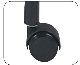
2061 Casters Industrial Caster adds 2" height. Fits 2020, 2030 series