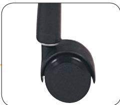
2164 Caster Reverse braking caster brakes when seat is occupied. Fits 2020, 2030 series