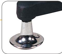
2161 Glides Large steel glide with 2 1/2" diameter. Fits 2016, 2040, 2050, 2080 series