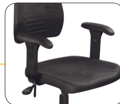
2076N Armrest "T" Pad adjustable armrests. Fits 2006, 2016, 2026, 2036, 2046 chairs