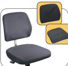
2172 Slip Cover Padded foam slip cover. Durable nylon fabric. Fits large Polyurethane backrest only

Sold in sets. Material is Denier Nylon Cordura