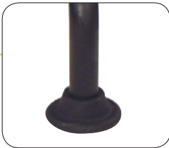
2066N Glides Industrial glide with 2 1/2" diameter. Fits 2020, 2030 series

Accessories enable you to customize your chair selection with glides, casters, armrests, footrests and other items to add comfort and convenience. Be sure to note description for compatibility with specific chairs, since accessories are not always interchangeable.