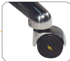
2071CR Caster Hard floor conductive caster adds 1" height. Fits 2043CRN, 2046CRN, 2050ESD series