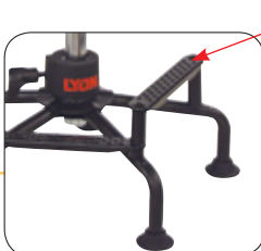
2080N Footrest High footrest Fits 2030 series