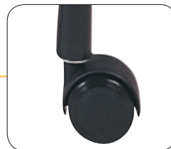
2162 Caster Braking casters brake when seat is not occupied. Fits 2020, 2030 series