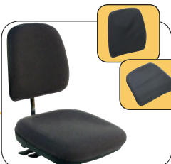
2174 Welding Cover Fits 2024, 2034, 2034X, 2044 chairs