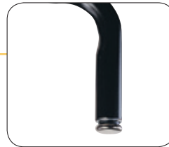
2166 Glides Small steel glide. Fits 2020, 2030 series