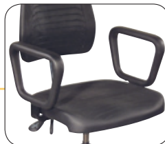
2067N Armrest Loop armrest assembly. Fits 2025, 2026, 2035, 2045, 2085 chairs