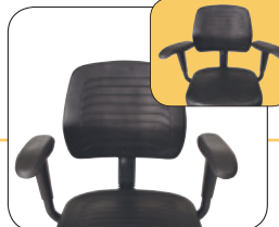
2077N Arms Adjustable Polyurethane arm pads rotate 30°. Designed for 1990, 1991 chairs. Also fits, 2024N, 2034N, 2044N, 2084N, 2044TC, 2043CRN chairs