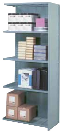
Five Shelf Closed Add-On