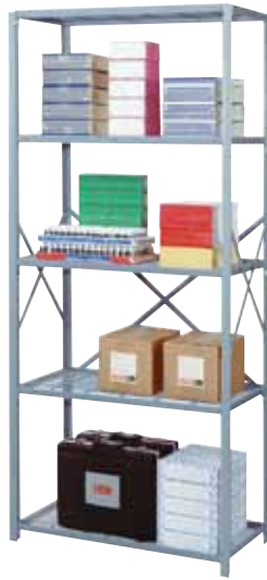
Five Shelf Open Starter