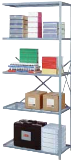
Five Shelf Open Add-On