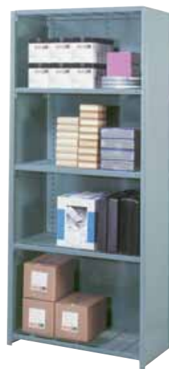
Five Shelf Closed Starter