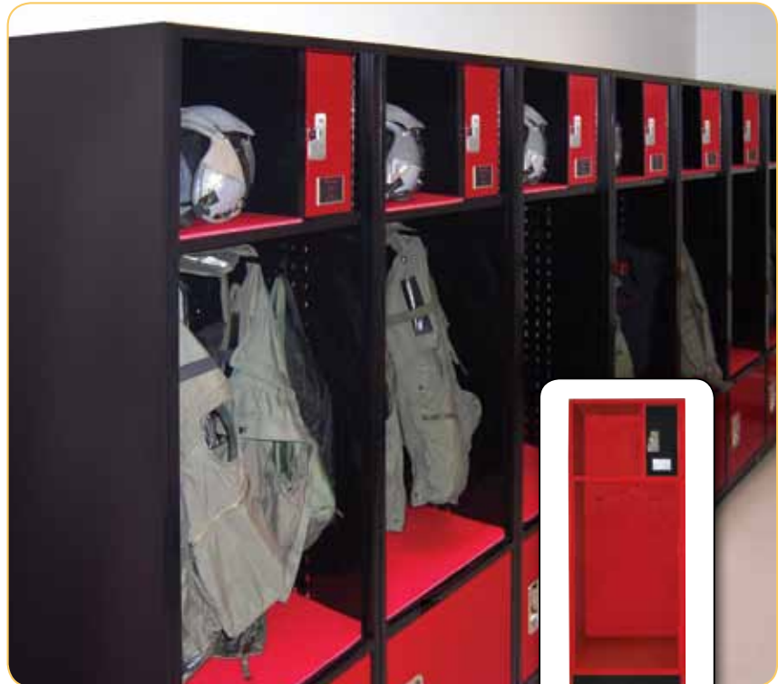
Hill Air Force Base, Utah. Shown with field supplied pads. Pads not included.

Lockers can also be custom painted in Flight Squadron colors.