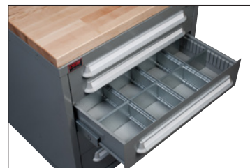
Layout Kit Installed