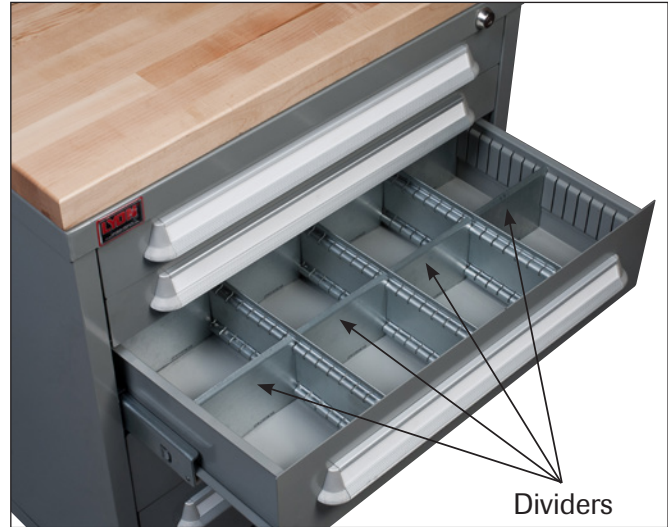
Divide a drawer into eight compartments by adding four dividers to three partitions.