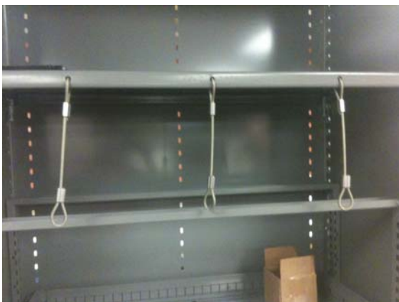
Final shelf assembly with 3 cable assemblies