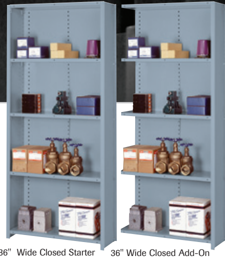
36" Wide Closed Starter