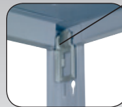
Shelf Clips All shelving units are shipped with 4 per each shelf clips.

Closed Shelves protect packages and unboxed items from dust, sunlight and other contaminants. Divide work or storage space into separate areas.