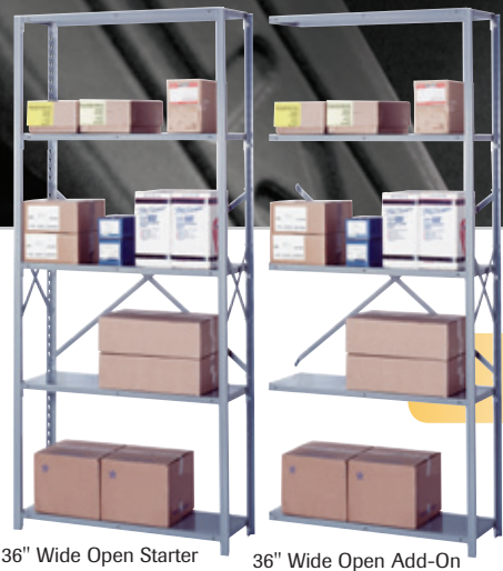
36" Wide Open Starter