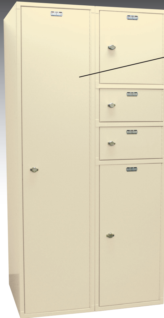
Evidence Pass Thru