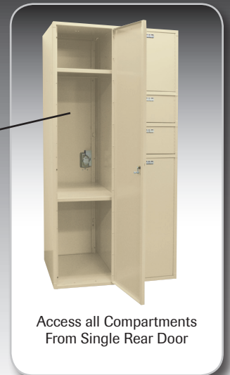
Access all Compartments From Single Rear Door