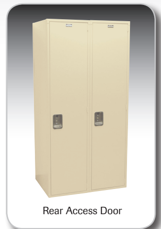
Rear Access Door