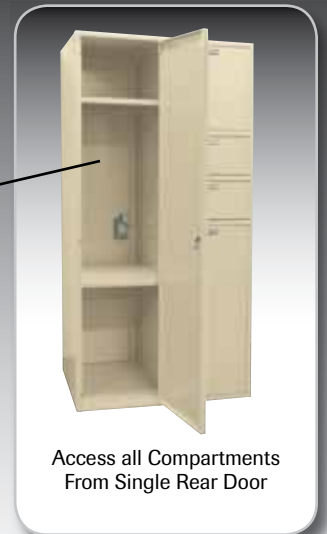
Access all Compartments From Single Rear Door