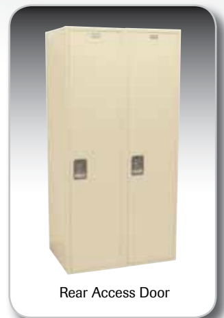
Rear Access Door