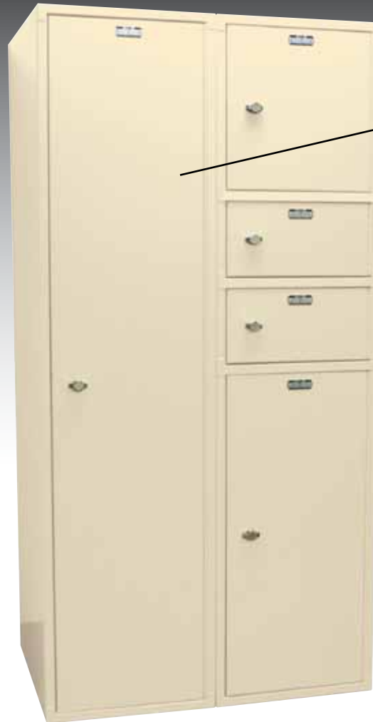
Evidence Pass Thru