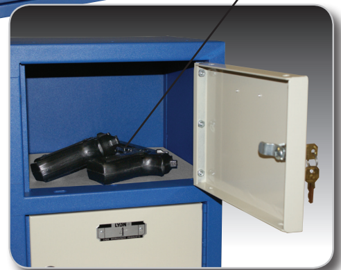
Securely Store Pistols