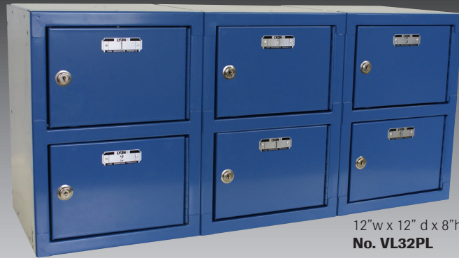
12" w x 12" d x 8" h No. VL32PL