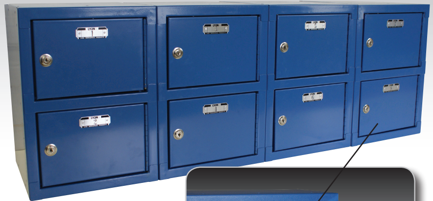
12" w x 12" d x 8" h No. VL42PL