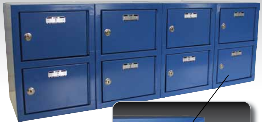
12" w x 12" d x 8" h No. VL42PL