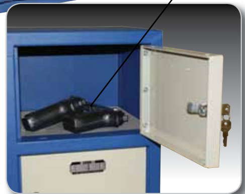
Securely Store Pistols