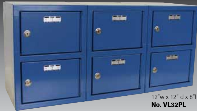
12" w x 12" d x 8" h No. VL32PL