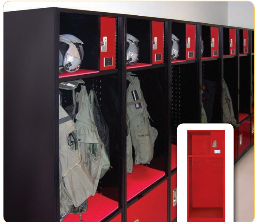
Hill Air Force Base, Utah. Shown with field supplied pads. Pads not included.

Lockers in photos are custom painted in Flight Squadron colors. Call customer service to order lockers in your squadron colors.