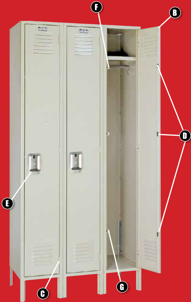
Standard Quiet Design