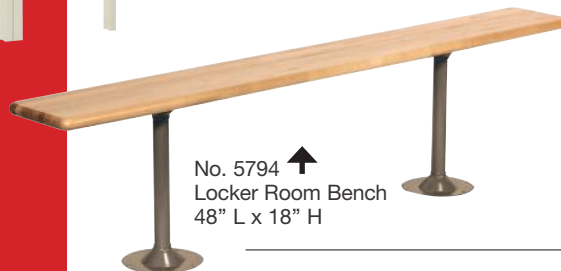
No. 5794 ↑ Locker Room Bench 48" L x 18" H