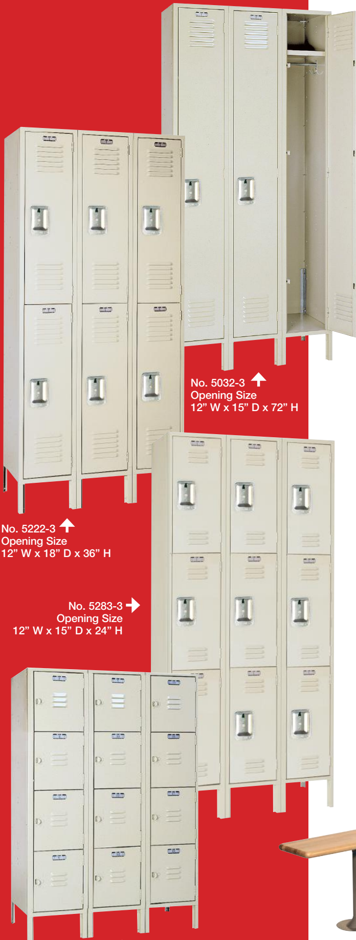
No. 5032-3 ↑ Opening Size 12" W x 15" D x 72" H

Nano metal roller with latch finger An independent study concludes that the nano metal roller latching system has passed their 40,000 test cycles, which translates to decades of flawless security.