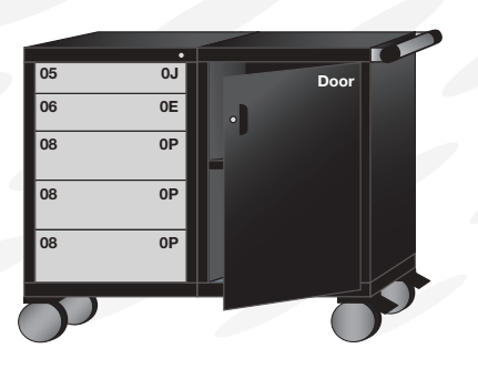
5 drawers with 104 compartments base shelf and adjustable shelf behind lockable swing door

S352230W1001 - 45-5/8"w S353030W2001 - 60"w