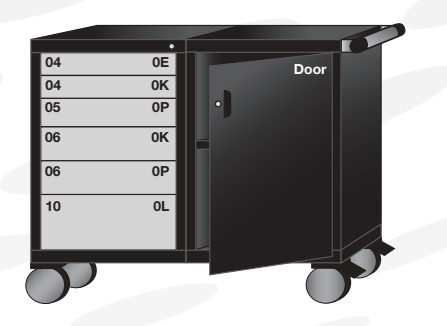
6 drawers with 108 compartments base shelf and adjustable shelf behind lockable swing door

S352230W1001 - 45-5/8"w S353030W2001 - 60"w