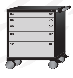
5 drawers with 92 compartments overall height = 38-5/8"