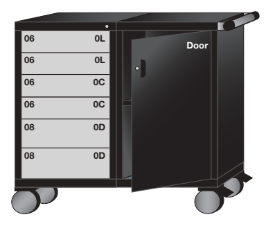
6 drawers with 58 compartments base shelf and adjustable shelf behind lockable swing door