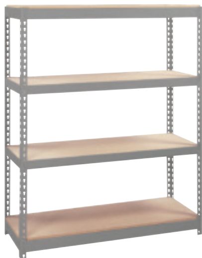
Photo for illustrative purposes only. Particle board and wire decking sold separately