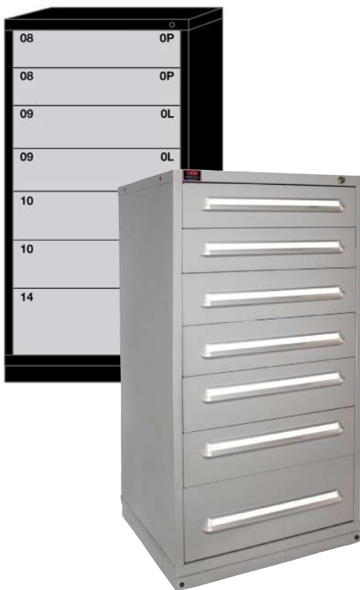
Shown Above: Layout drawing and final product of the Standard Eye-Level 7-drawer 683030000G Cabinet