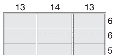
18"d Layout Kit