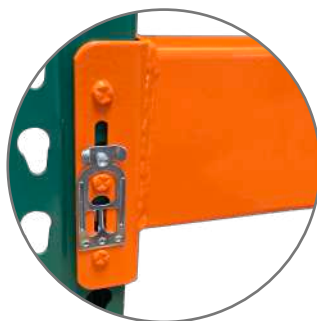
Beam with Safety Lock